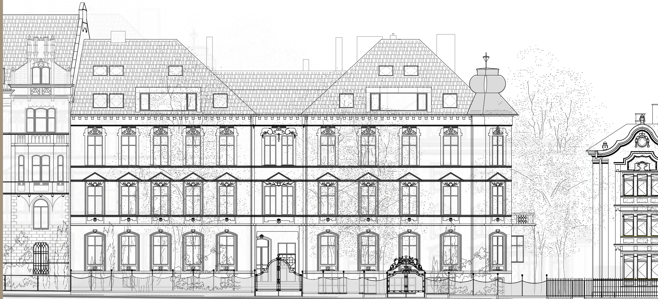
POHLAD OD ULICE / STREET ELEVATION