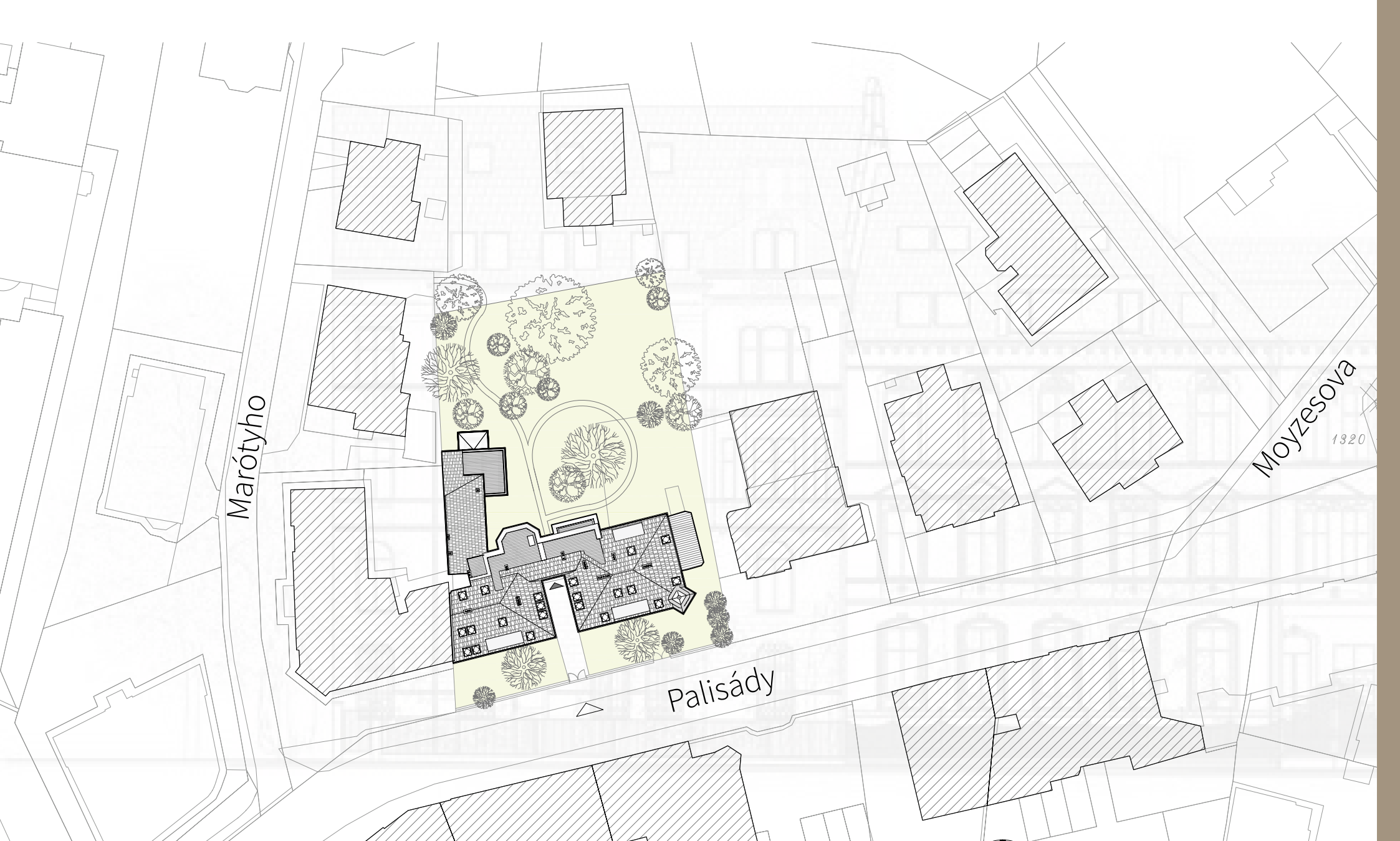
SITUÁCIA / BLOCK PLAN